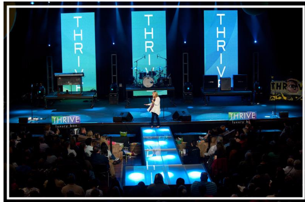
Thrive Conference 2016 takes place April 28-30 at Bayside Granite Bay Campus.

These Warriors live up to their name in post season play at the NAIA National Championship.