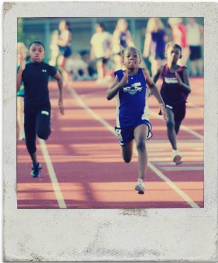
Revolution Express Track Club Meet on April 30 at Rocklin High School.