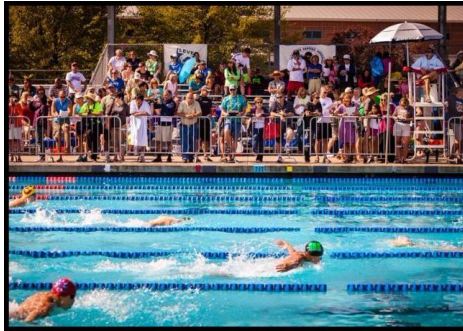
CCA's Spooktacular Swim Meet comes to the Roseville Aquatics Complex Oct. 7-9.