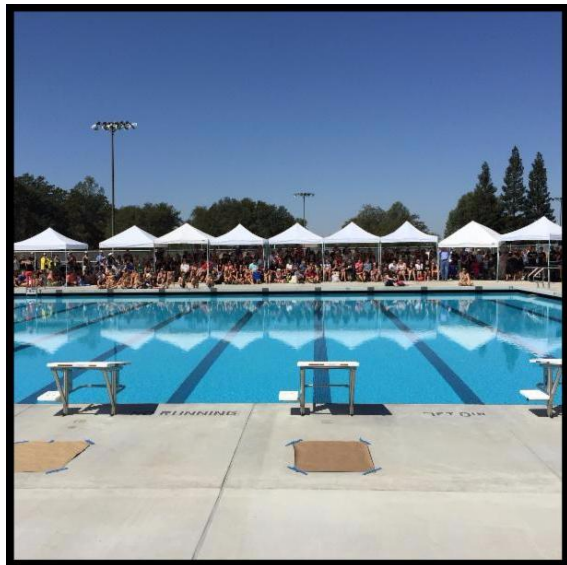
On Monday, Sept. 5, Labor Day, Del Oro High School in Loomis officially cut the ribbon on their beautiful new pool.