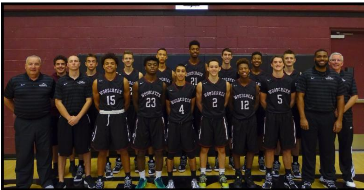
Woodcreek High School 2016-2017 Boys Varsity Basketball Team

Click here for more information on Rockwood Boys Varsity Basketball Tournament.