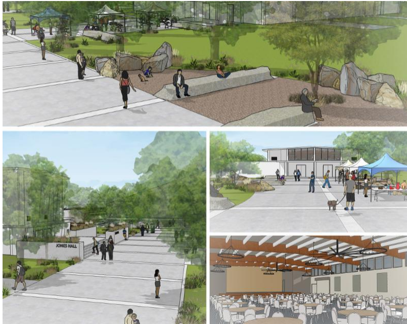
The future look of the Placer County Fairgrounds.

Late fall of 2017 is the target completion date. The estimated cost for these upgrades is 7 to 8 million.