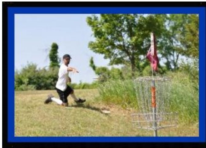
The Rocklin Pro Am Disc Golf Tournament will take place at Johnson Springview Park on July 29-30.