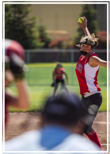
USA Softball NAIA Summer Explosion Showcase comes to Placer Valley on June 2-4.