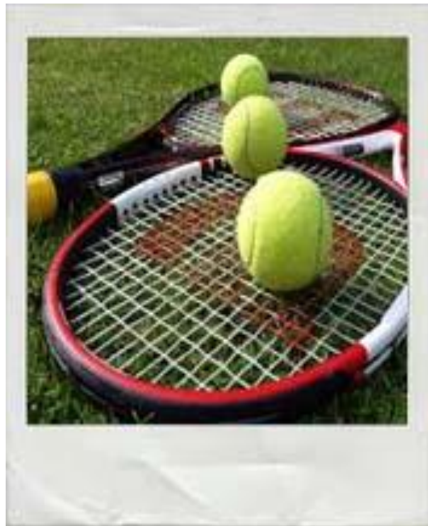
Johnson Ranch Racquet Club in Roseville will host the USTA 55+ Adult Tennis Sectionals on Sept. 21-24.

July 2017: 79.8% July 2016: 85.3% YTD: 76.7% Prior YTD: 75.8%