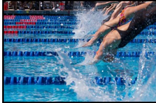
The 21st Summer Sanders Swim Meet returns to the Roseville Aquatics Complex on June 7-10.

April 2018: 78.1% April 2017: 75.0% YTD: 75.4% Prior YTD: 74.7%