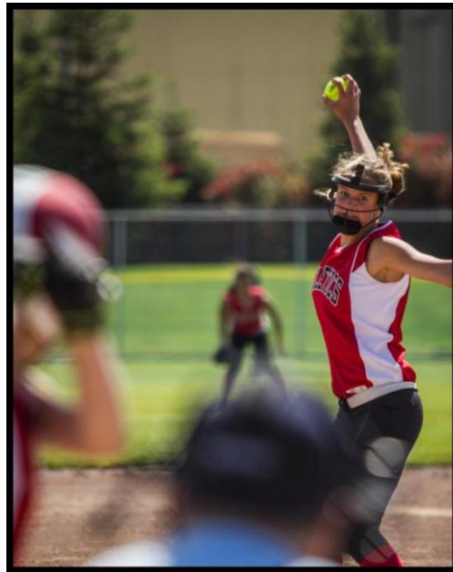
The USA Softball Western National Championships 16u/18u arrive in Placer Valley from July 23-29.